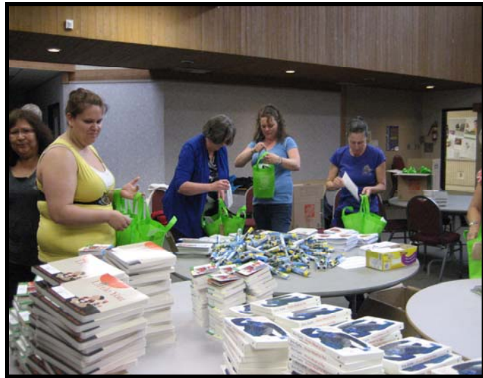
Task Group Assembles Books for Babies Bags