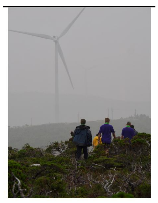
North Island wind farm, Port Hardy